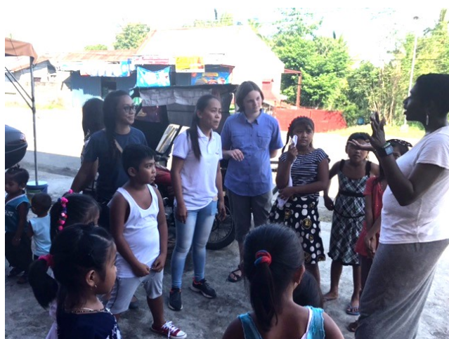
Teaching children during the gospel meeting Philippines Mission Trip 2017