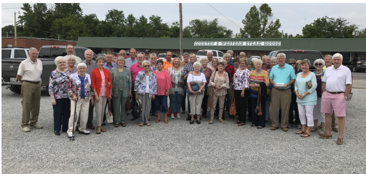
Senior Ministry Outing to Country & Western Restaurant in Camden, TN last Thursday.